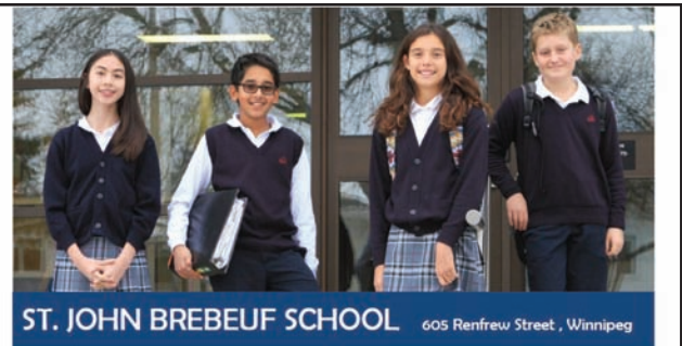
ST. JOHN BREBEUF SCHOOL 605 Renfrew Street, Winnipeg